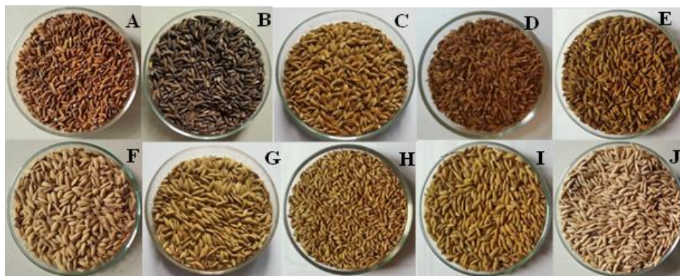
Figure 2. A-Suwandel, B- Kaluheenati , C- Kuruluthuda , D- Madathavalu , E- Pachchaperumal , F- Pokkali , G- Suduheenati , H-BG 360, I-BG 352 and J-AT 362 varieties.