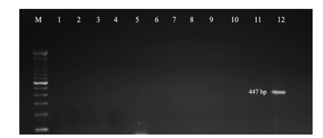
Figure 1. Representative agarose gel electrophoresis of PCR products from milk samples. Lane M: 100 bp DNA ladder, 1 – 11: DNA from milk samples, 12: M. bovis positive control DNA

in different countries have shown widely different results for the presence of M. bovis in SICCT positive cow milk varying from 0 to 50% (Romero et al. , 1999; Perez et al. , 2002; Zumárraga et al. , 2005).