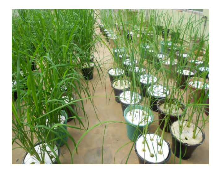
Plate 1. Plants in the green house at 40 days of age

Growth medium was maintained at pH of 5.6-5.8 by adjusting pH in every 2 days and solution was replaced once a week. Design of the experiment was a Complete Randomized Design with 3 replicates and data collected were; days to tillering, shoot and root dry weight and shoot P concentration. At tillering stage of each variety, plants having only 2 tillers per plant were harvested. Shoots and roots of harvested plants were separated, oven dried at 80 °C for 72 h and dry weights were measured.