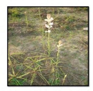
Mutant 6 Mutant (With 0.2 per cent EMS treatment in cv Prajwal)