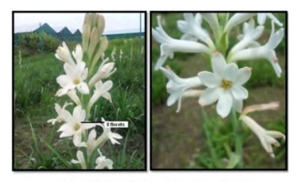
Mutant 3 (With 1.2 Kr X-rays treatment in cv Prajwal)