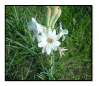
Mutant 4 (With 0.2 per cent EMS treatment in cv Prajwal)