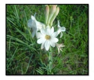
Mutant 4 (With 0.2 per cent EMS treatment in cv Prajwal)