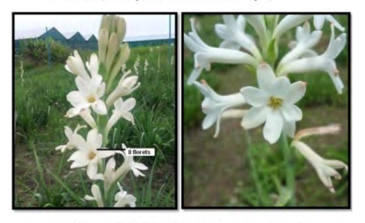
Mutant 3 (With 1.2 Kr X-rays treatment in cv Prajwal)