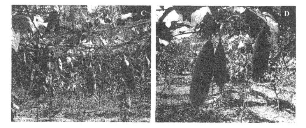
Plate 1. Flowering and fruiting of Luffa cylindrica . A. male flowers in reproductive mature stage; B. female flower 2-6 day after bud initiation; C. horizontal type trellising method; D. mature fruits

Many research findings indicate that, sponge gourd to possess resistant to pest and diseases in comparison with L. actangula . Observations made during the study also proved such findings. During the growing period it was observed that only 2-3 plants were affected by the leaf minor attack, but it was also a mild infection and not spread to the other plants. It is well known that luffa is severely affected by fruit fly damage and it sometime becomes a determinant factor to the final yield. In the present study, fruit fly damage was very mild and was not a detrimental factor to the final fruit yield. Such findings underscore the potential of sponge gourd to grow with minimal external inputs leading to low cost of production, qualifying it as a candidate crop for organic farming.