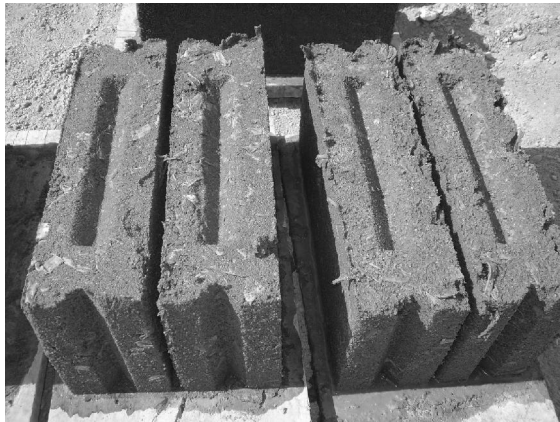
Fig. 2. Textile waste mixed solid cement blocks