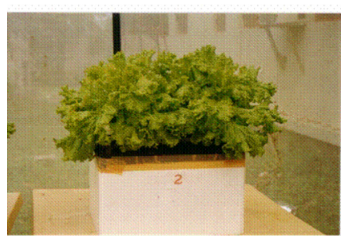
Plate 1. Arrangement of plants in the stationary culture system.

used as the control and the experiment was conducted as a complete randomized block design (CRBD).